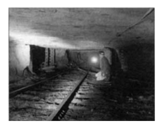
Dad in the mine. For some reason, he didn't wear his usual white foreman's helmet on the day this photo was taken.