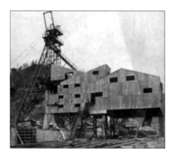
The Coalwood Olga Coal Company tipple.