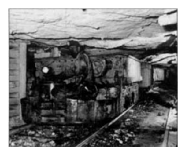
A Coalwood Olga Coal Company "man-trip," the kind my dad and I rode in when he tried to convince me to become a mining engineer.