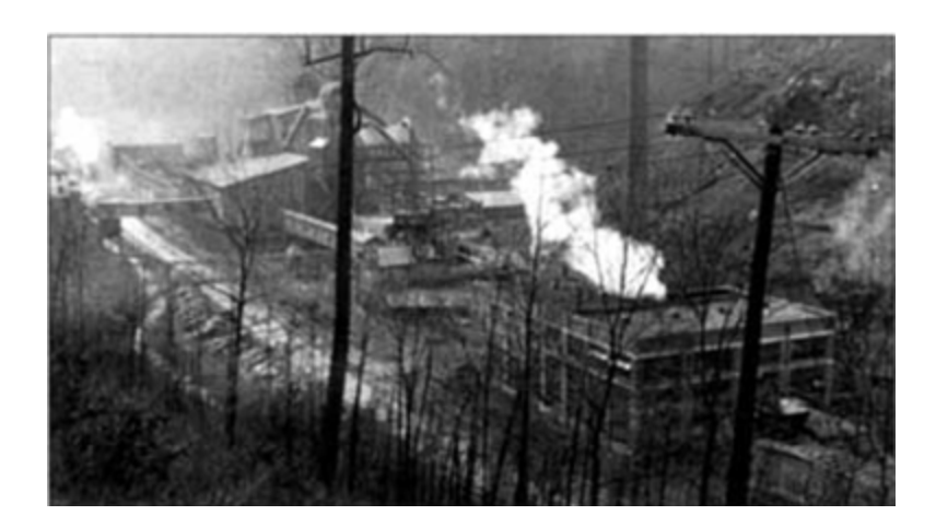
The Coalwood Mine: Mr. Bykovski's small machine shop was located in the brick building at the lower right. Our house was just a hundred yards to the right of that building.